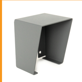
Optional: EMX-1915-1 IRB-MON2-4X2-HD-GREY