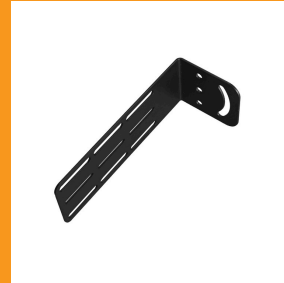
Optional: HRD-288-1 Universal Mounting Bracket