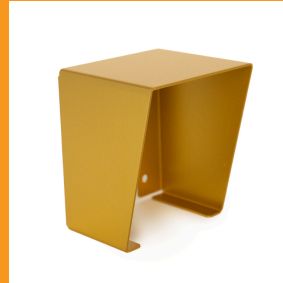
Optional: EMX-1916-1 IRB-MON2-4X2-HD-GOLD